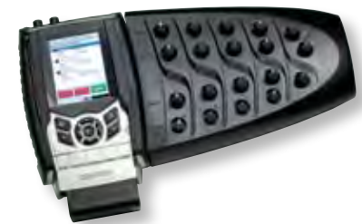
The optional mixer for the ACCESS Portable means you have to lug a LOT less gear to get a LOT more accomplished.