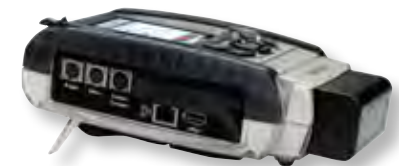
Data connections on the Access Portable are easy to access.