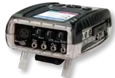
An integrated stand makes ACCESS Portable a table-top codec with conveniently located audio connections.