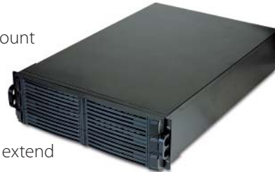
6kVA Single Phase UPS Rack Mount Extended Battery Run Times (minutes)

Optional matching battery packs are available to easily extend the UPS runtime to several hours.