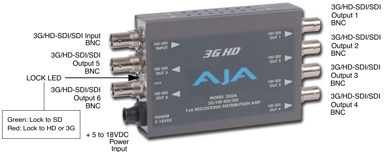
3GDA, Side View