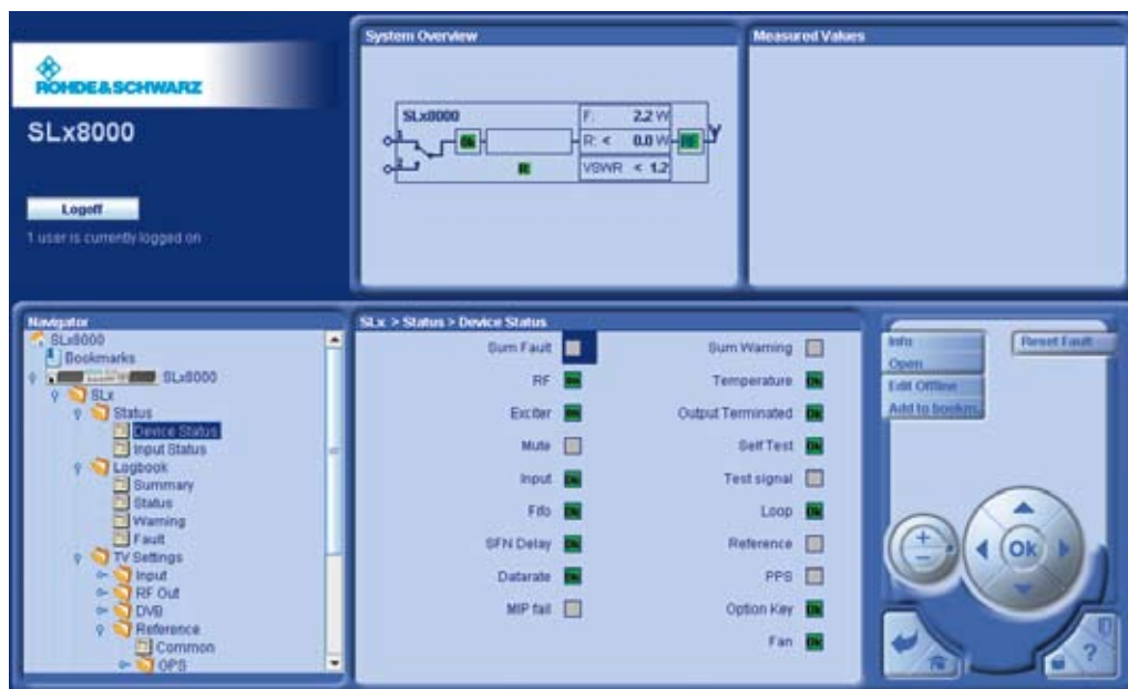
Convenient operation of the R&S®SLx8000 transmitter family via web browser.

The output stages in the transmitters for digital standards are precorrected for all specified frequencies and power levels. After a change in frequency or power, the automatic set&go function loads the appropriate precorrection curve in the background. Manual precorrection is therefore not necessary when a transmitter is put into operation or when a channel is changed. The available precorrection curves make it possible to reduce the power by as much as 10 dB below the nominal power throughout the entire frequency range.