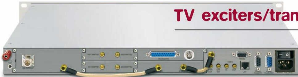
BLUE DIGITAL VIDEO 1HE rear view