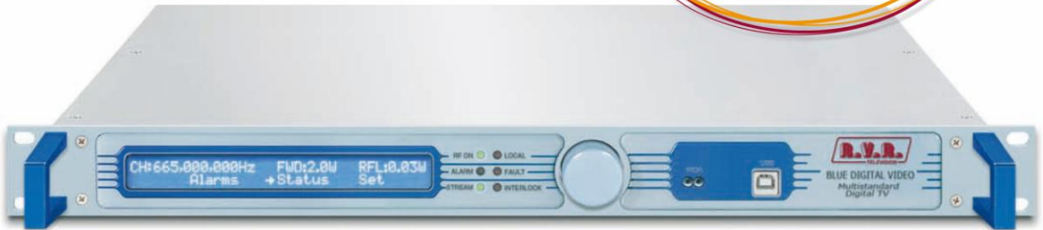
BLUE DIGITAL VIDEO 1HE front view